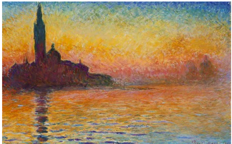
San Maggiore by Twilight Venice 1908

Build -Impressionist works broke away from traditional academic painting (which focused on historical or mythological scenes) with several defining features: